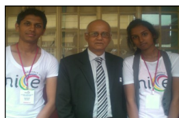
Our budding Journalists

What is your overall experience of NICE?