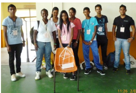
(House construction Game—sharing knowledge and skill through leadership qualities )