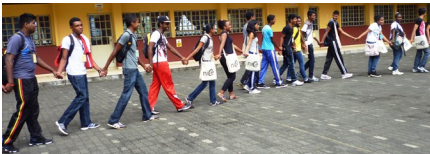
(Energizer - staying together even in difficult times.)

Team building Activities by officers of Ministry of Young and Sports: